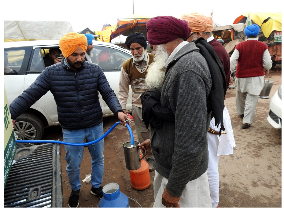
Singhu Border, January 8, 2021