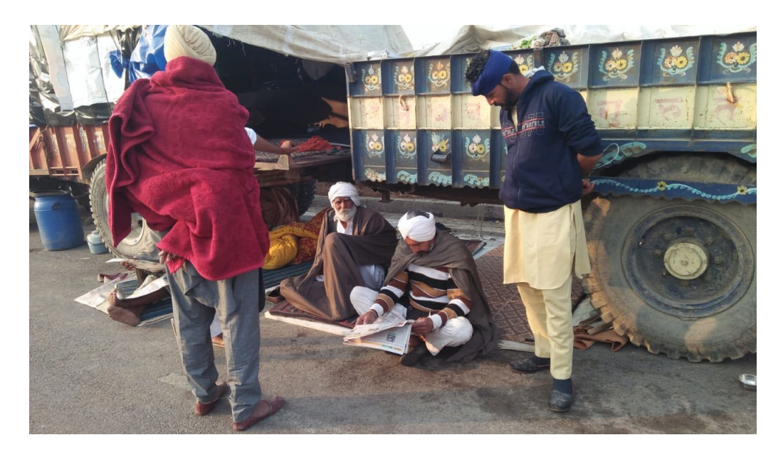
Tikri Border, December 4, 2020