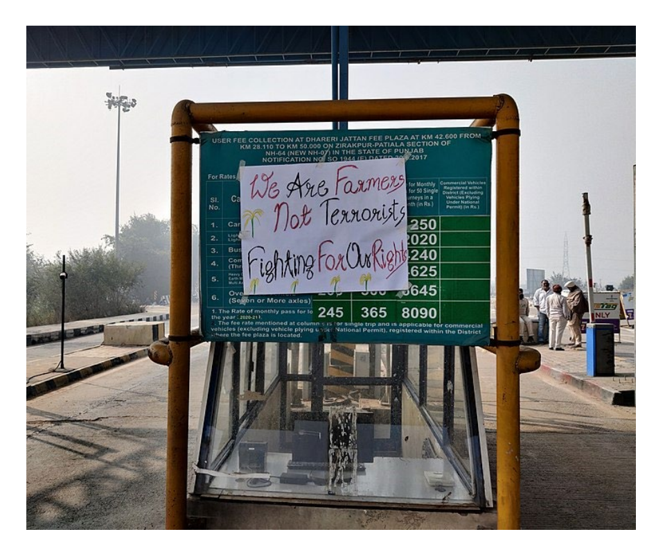
Dhareri Jattan, Patiala, December 21, 2020