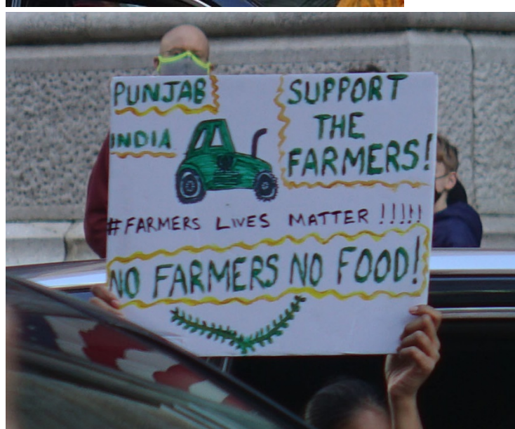
New York City, December 13 2020