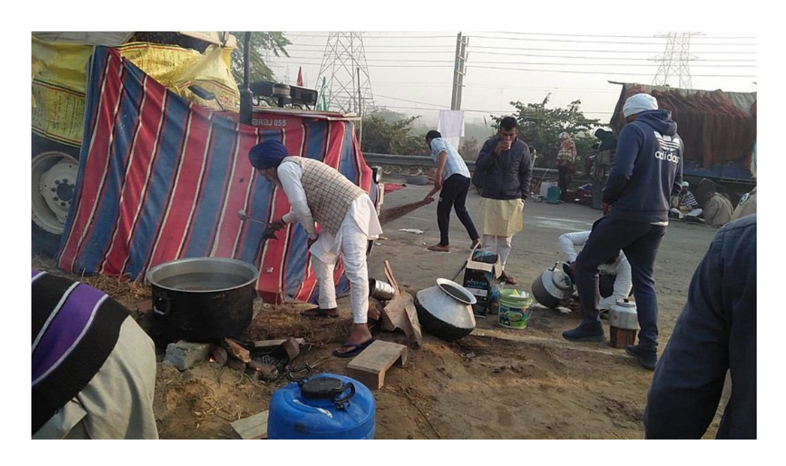
Tikri Border, December 4, 2020