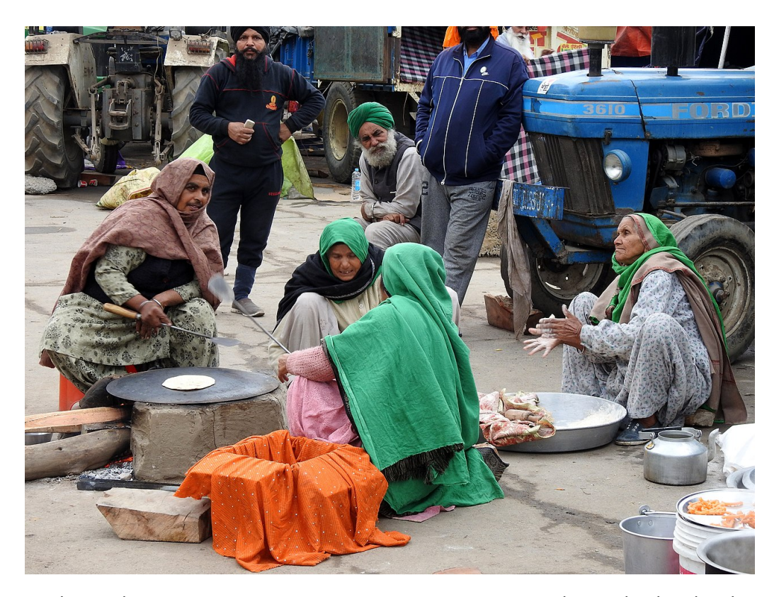
Singhu Border, January 3, 2021