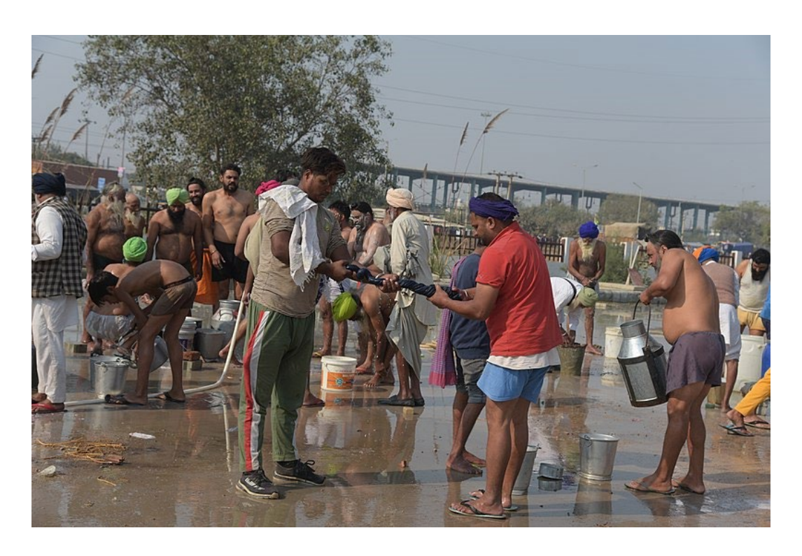
Singhu Border, November 29, 2020