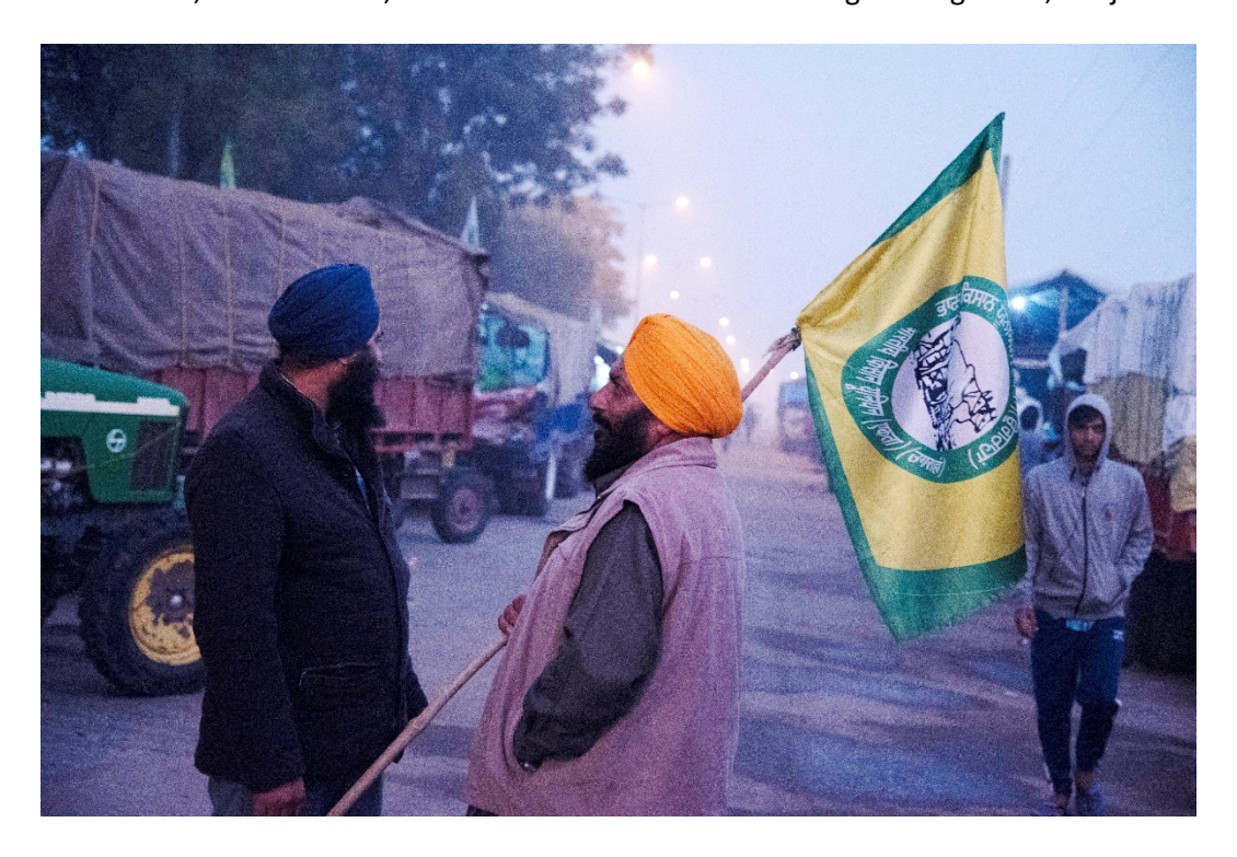
Near Delhi, December 5, 2020