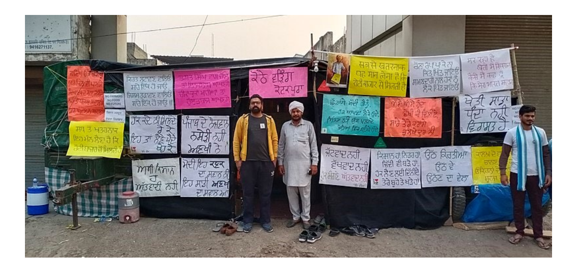
Tikri Border, December 27, 2020